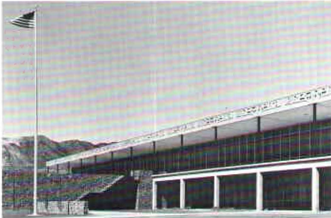
Colorado Springs plant is contemporary in design, makes striking use of native stone. Employment will reach 450 early in 1965.