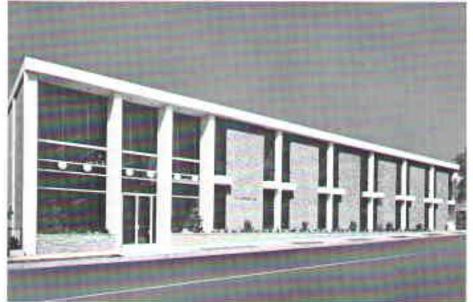
Moseley Division's beautiful addition provides much-needed room for a model shop, engineering, sales, administrative, and management people.