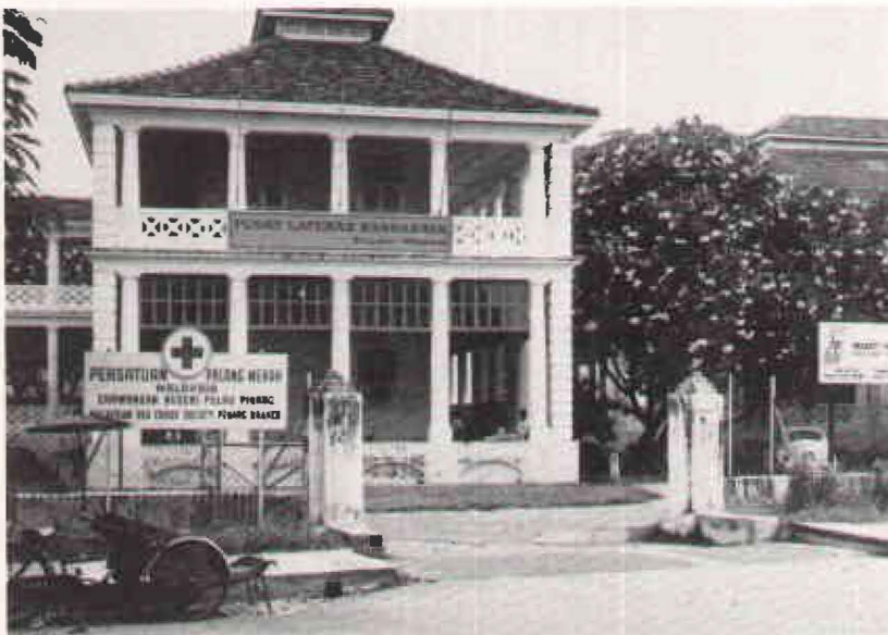
Victorian-style building that formerly housed Red Cross and where HP Penang got its start, serving as a training and headquarters building until new plant was opened recently.