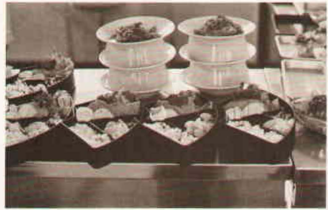
At YHP cafeteria near Tokyo, at left, the choice is between chopsticks and fork. The meals, displayed at right, reveal Japanese ability to prepare food that appeals to the eye as well as the taste.