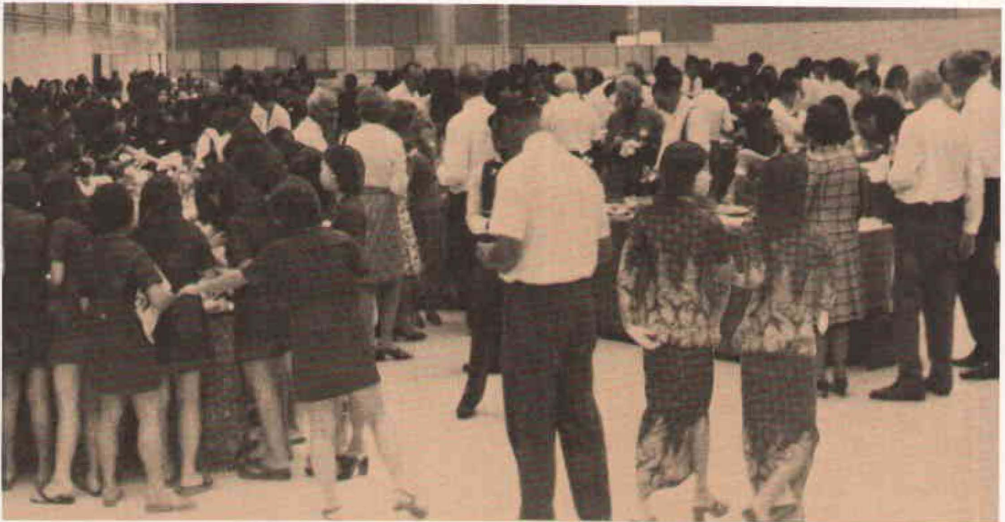
A lively gathering resulted when two shifts of employees at HP Penang met with company directors for a buffet lunch early last month. The visit by directors followed a board meeting in Japan and a stop at HP Singapore.

Then consider Hewlett-Packard's experiences in such an environment, specifically on Penang, a 110-square mile island only a mile or so offshore from the lush west coast of mainland Malaysia.