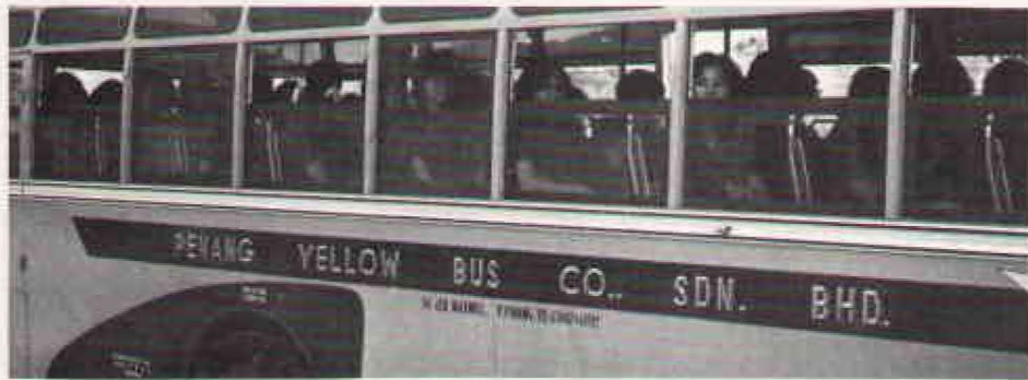
One distinctive feature of HP Penang is the free bus service provided between plant and Georgetown, a 10-mile ride.