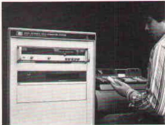
At left is the 3050B automatic data acquisition system from AMD, representing usage in a standard-type system, one which uses a scanner with multimeter and calculator for a low-cost solution to data gathering and data reduction.