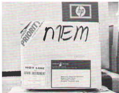
2. "Hot-line" phone service can provide almost immediate turnaround of orders urgently needed by a field office or on behalf of a customer. Marcia Sullivan is one of four parts order processing people at the Mountain View center on full-time "hot-line" duty.