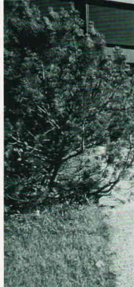
HPSA headquarters, Geneva

The early 1970's saw the formation of HP's group structure, with each of the six groups having worldwide responsibility for sales of its product lines. The resulting “verticalization” of the selling effort required tremendous adjustments at every