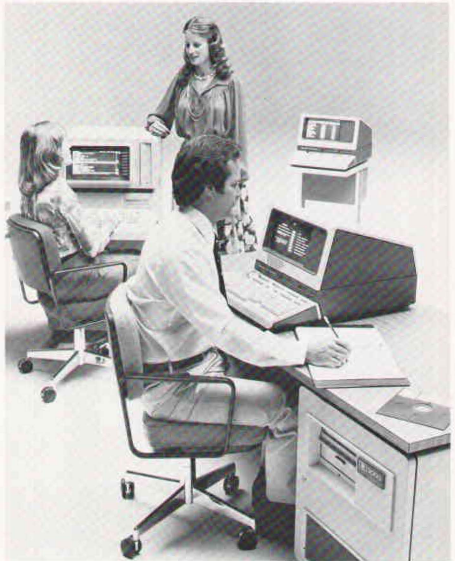
New HP 3000 series 33 computer system

That effort is moving ahead fast. HP has already received one of the computer industry's most coveted honors, a DATAPRO award for the information-management scheme we call IMAGE, which made it easier than ever before for HP 3000 owners to command their machines to sort over vast quantities of stored information, find and relate facts so as to extract meaning. In the year we