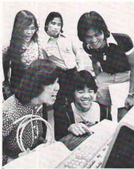
Students' days at Santa Clara and Cupertino divisions attract scores of minority high schoolers from the area for a hands-on experience with industry.