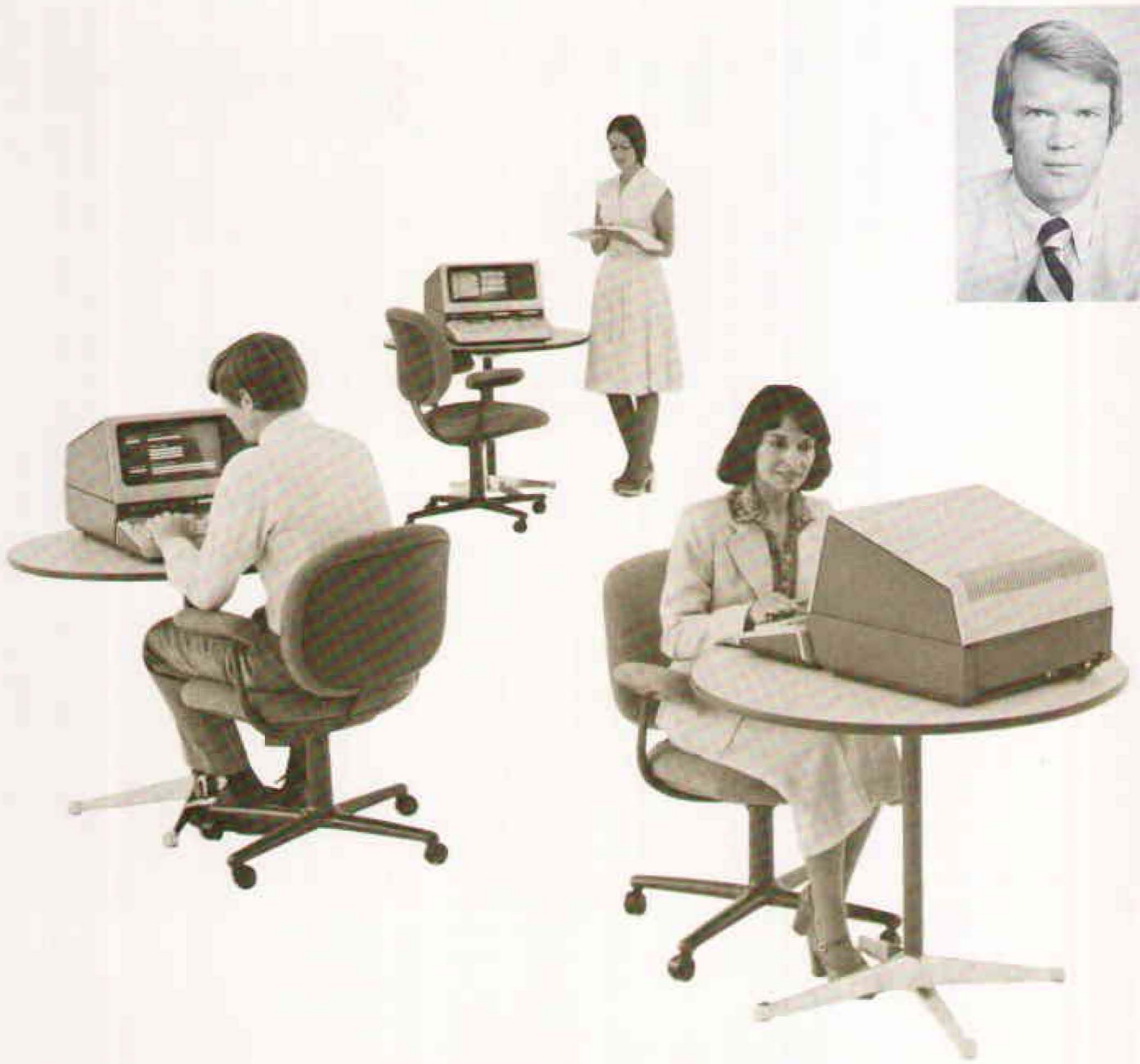
New HP 300 computer system