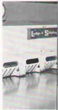
Stepping into the role of certified sheetmetalst came quite naturally for Norma Pierce at Colorado Springs Division.