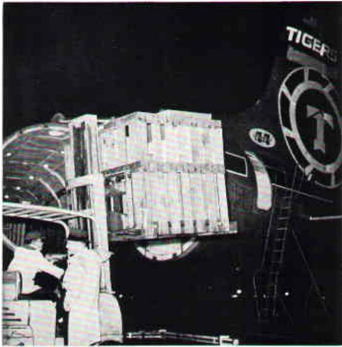
Flying Tiger line uses swing-tail all-cargo aircraft. HP's consolidated shipments are loaded at about 6:00 p.m.