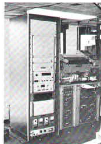
Top: Atlantis II leaves Woods Hole for the open Atlantic. Left: Perry poses aboard Oceanographic Institute's research ship. Right: Dymec system collected temperature data during Bermuda voyage.