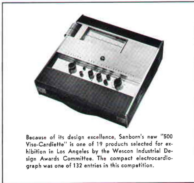
Because of its design excellence, Sanborn's new "500 Viso-Cardiette" is one of 19 products selected for exhibition in Los Angeles by the Wescon Industrial Design Awards Committee. The compact electrocardiograph was one of 132 entries in this competition.

from Loveland, magnetic tape recorder systems by Sanborn, three new high voltage power supplies from Harrison, Dymec data plotting systems, the HP spectrum analyzer, cesium beam standard, and some unique new plug-ins for the 175A scope.